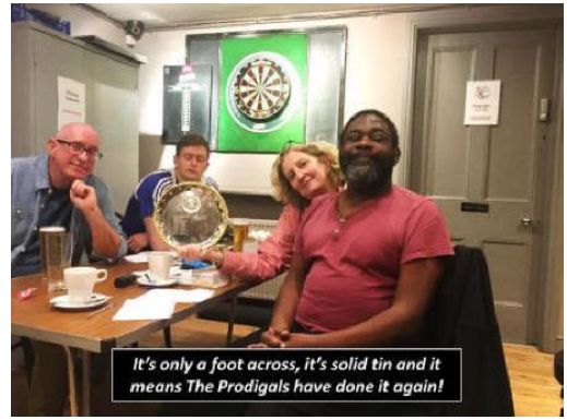
The History Men lift the Val Draper Cup - The Prodigals add the Plate to their A-Trophy victory

Thoughts of Mike B: '...a lengthy low-scoring paper which kept all concerned at it until just about 11pm...a pity we should end the season with such a drawn out affair... if the questions are too hard then inevitably there is much head-scratching and repetition....perhaps it is time to reconsider the format we use for these Cup final papers... Some excellent material... the Electric Pigs 'Fraternal round' was much enjoyed...after gradually clawing back their handicap disadvantage, ...the scores were level going into the very last question...colleagues persuaded away from what proved to be the right answer...when the question was passed across to the History Men they got the steal and nicked the Cup.... the History Men voted the 'Brothers round' as best on the night with the 'Containers round' a close second; the Parks round scoring 'nul points' (probably because we also scored nul points on that round)....'